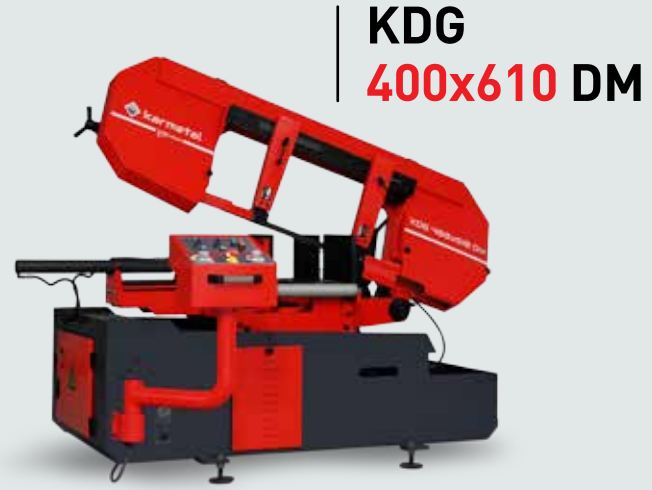
KDG 400x610 DM