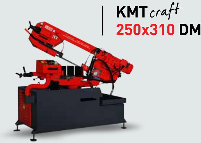
KMTcraft 250x310 DM