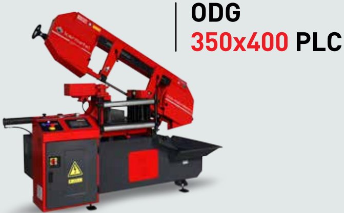
ODG 350x400 PLC