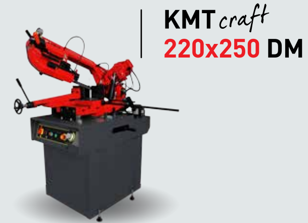
KMTcraft 220x250 DM