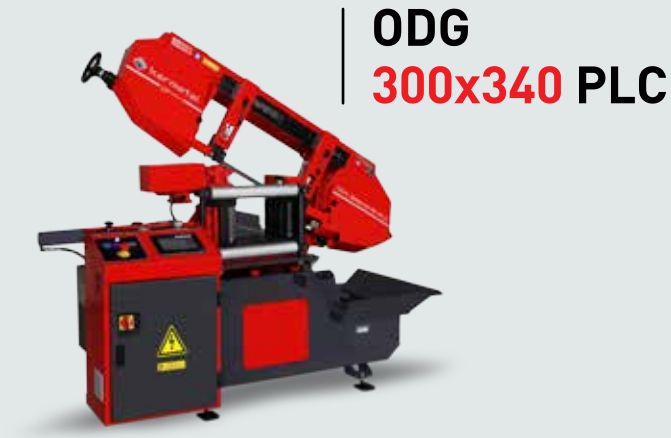
ODG 300x340 PLC