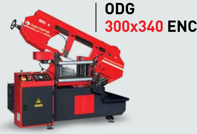
ODG 300x340 ENC