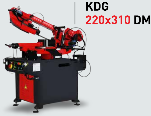
KDG 220x310 DM