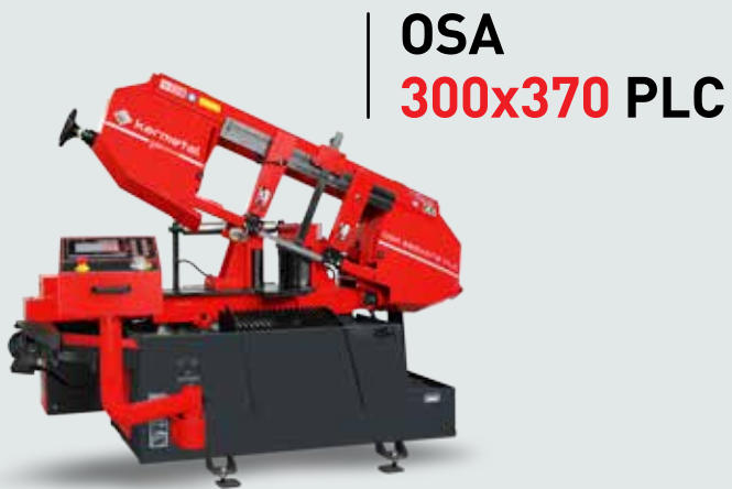
OSA 300x370 PLC