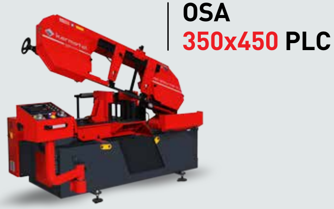
OSA 350x450 PLC