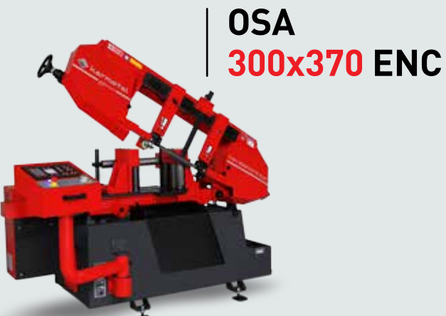
OSA 300x370 ENC