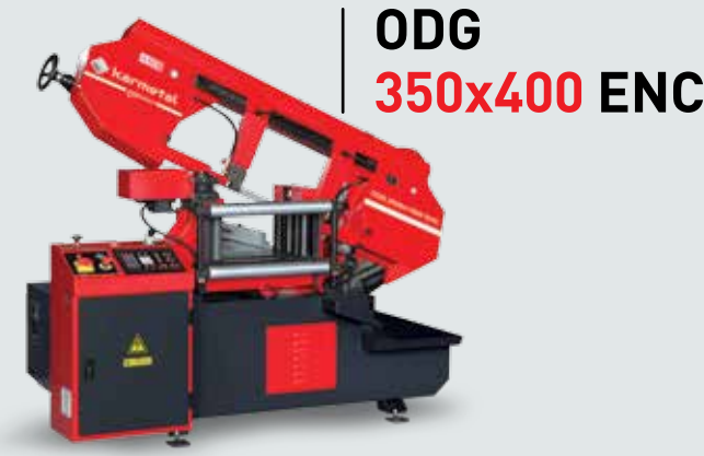
ODG 350x400 ENC