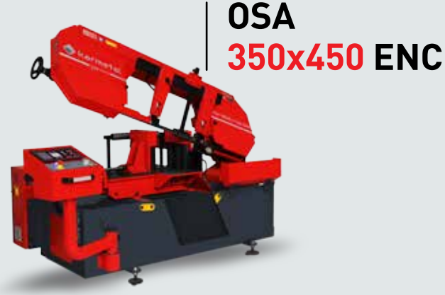
OSA 350x450 ENC